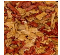
LF01-33 RED & BEIGE BLEND

Note: These colour swatches serve as an approximation only. Actual rubber colour may vary due to differences between screen or print colour as shown, and the true colour of the product.