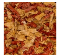
LF01-33 RED & BEIGE BLEND

Note: These colour swatches serve as an approximation only. Actual rubber colour may vary due to differences between screen or print colour as shown, and the true colour of the product.